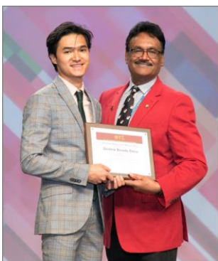
Phi Tau Sigma Achievement Scholarship

7. Enhance your college experience by pursuing excellence with others having similar values.